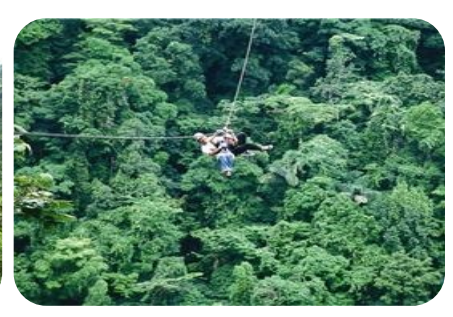
03/04/2019 12:00 PAX: 2