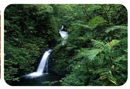
03/04/2019-03/06/2019 PAX: 2