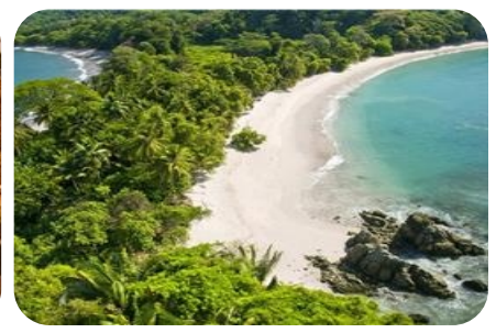
03/06/2019-03/09/2019 PAX: 4