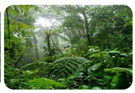
03/06/2019 00:00 PAX: 4