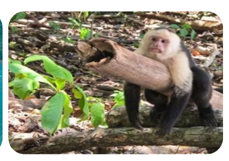
03/08/2019 PAX: 4