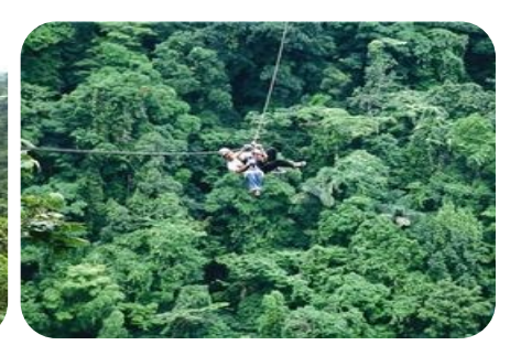
03/04/2019 12:00 PAX: 4