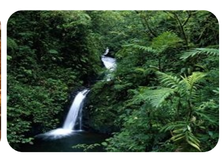
03/04/2019-03/06/2019 PAX: 4